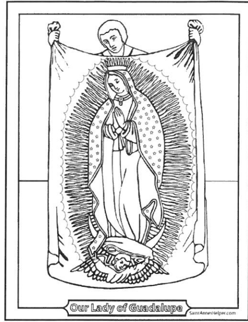
Our Lady of Guadalupe's feast day is December 12.