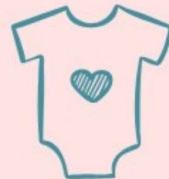
CLOTHING (UP TO 5T)