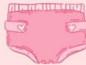
DIAPERS/ WIPES SIZES 5-6