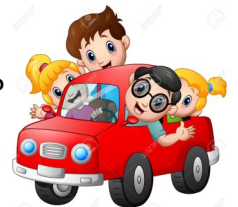
Ministry Schedule for next week (Nov 25/26)

What happens if we do not use our gifts? What happens when we do use our gifts? To whom do these talents belong?