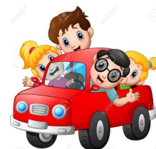
Ministry Schedule for next week (May 27/28)

I wonder how the disciples felt about Jesus’ words to “Go and make disciples of all nations.”